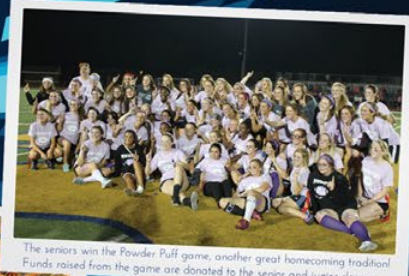
The seniors win the Powder Puff game, another great homecoming tradition! Funds raised from the game are donated to the senior and junior classes.