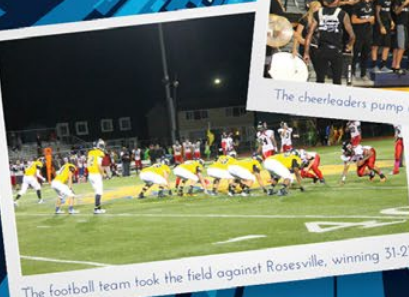
The football team took the field against Rosesville, winning 31-21.