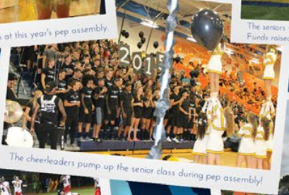
The cheerleaders pump up the senior class during pep assembly!