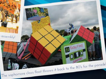
The sophomore class float throws it back to the 80's for the parade!